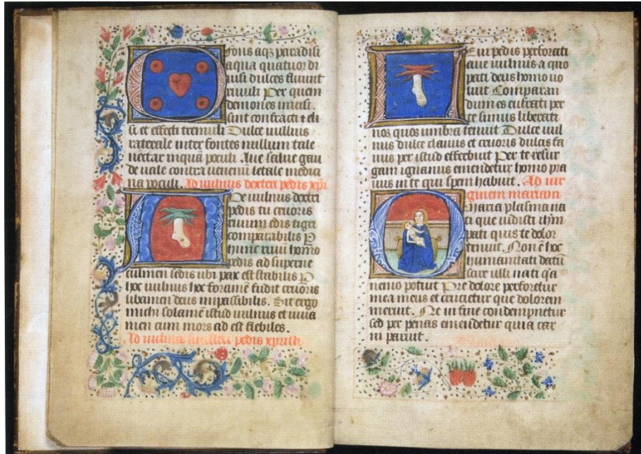
Prayers to the wounds of Christ and the Virgin with historiated initials, CEC MS I.2.20 ff. 4v-5r