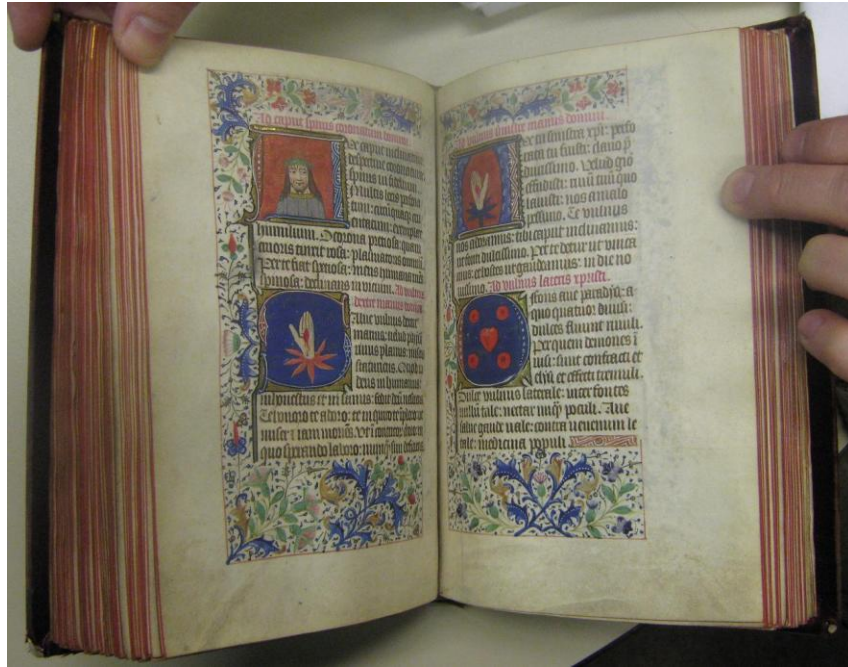
Prayers to the wounds of Christ with historiated initials, NHS Sarum MS ff. 89v-90r