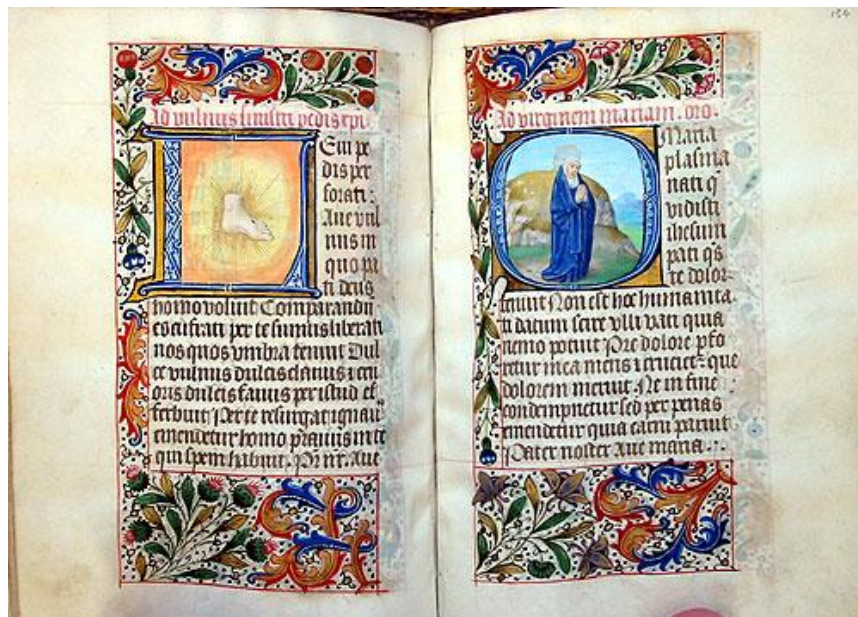
Prayers to the foot of Christ and the Virgin with historiated initials, OQC MS 349 ff. 133v-134r