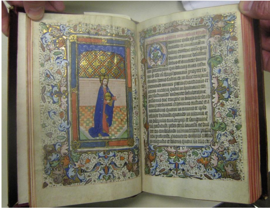
Full-Page Christ miniature with English style border illumination, NHS Sarum MS ff. 10v-11r