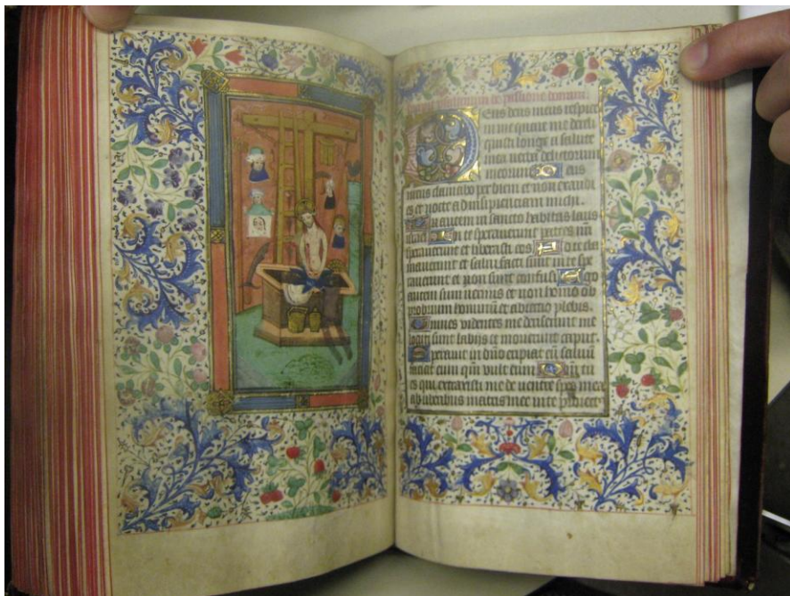
Full-Page Mass of St. Gregory miniature with Netherlandish style border illumination, NHS Sarum MS ff. 130v-131r