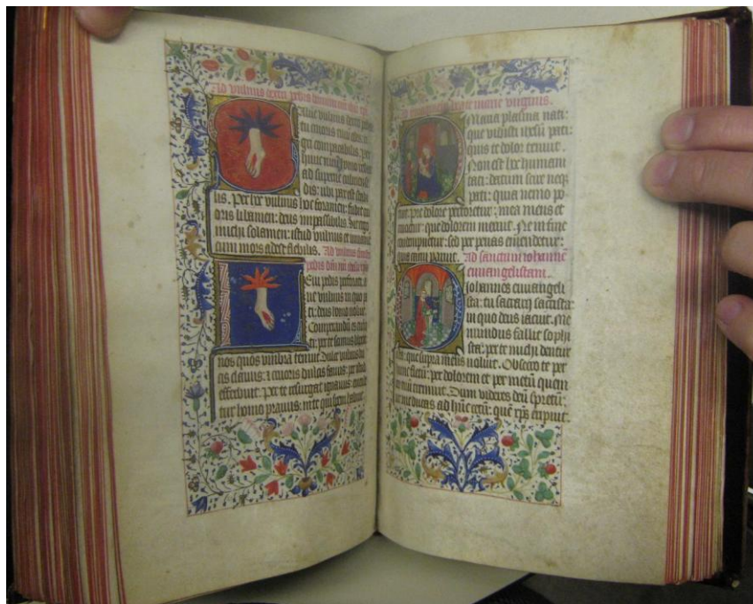
Prayers to the wounds of Christ, the Virgin, and St. John the Evangelist with historiated initials, NHS Sarum MS ff. 90v-91r